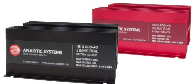
Available in three colours

While the Ideal Battery Isolator is designed to be used with an alternator, it can also be used to convert a single bank battery charger to a 2 or 3 bank charger.