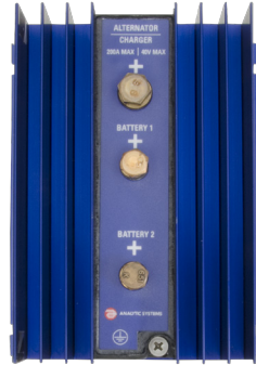
Top / mounted view