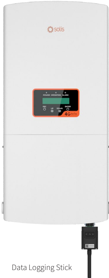
Data Logging Stick