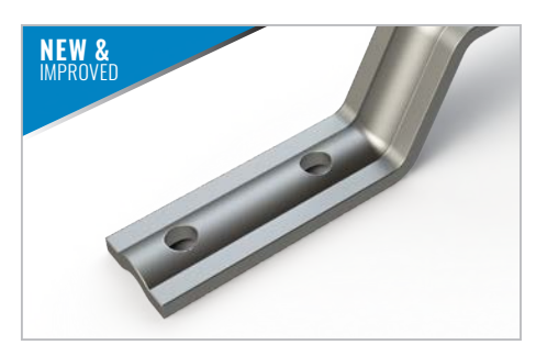
UP TO 60% STRONGER Exclusive POWER ARCH technology ensures no array rattling or broken tiles during high winds.