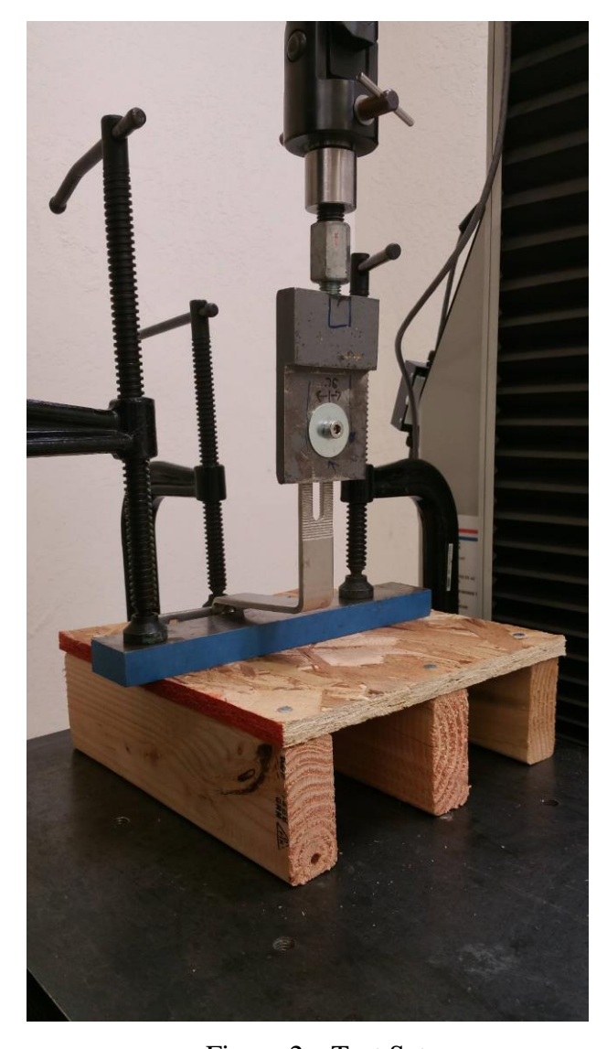
Figure 2a. Test Setup