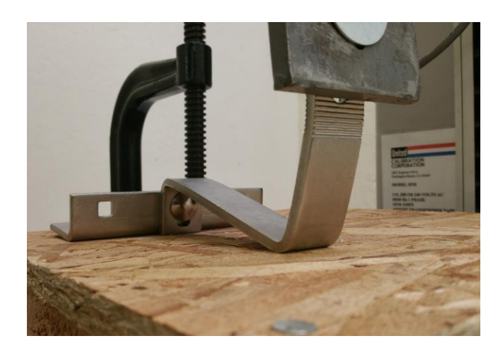
Figure 1b. Typical Failure Mode