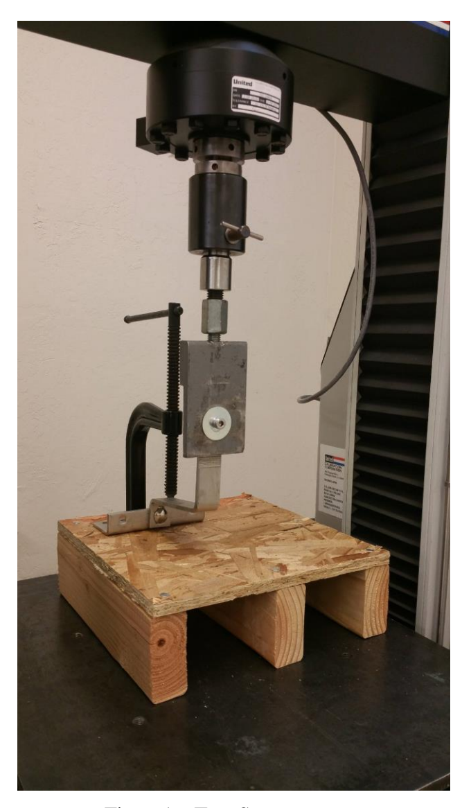
Figure 1a. Test Setup