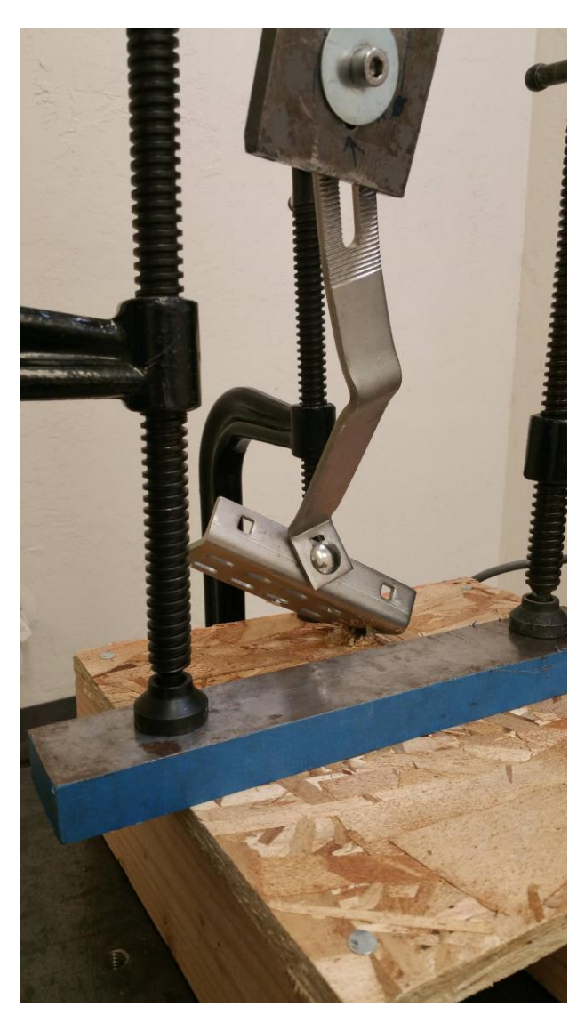
Figure 2b. Typical Failure Mode