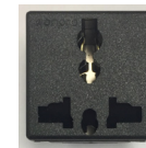
Worldwide 220V Outlet (220W Option)