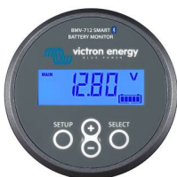
Bluetooth sensing: BMV-712 Smart Battery Monitor