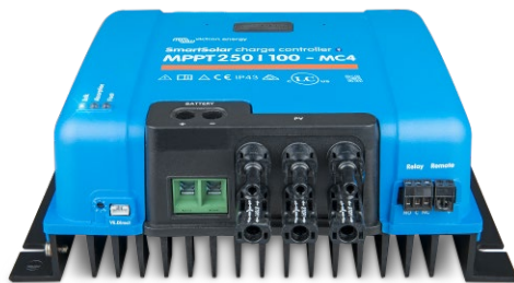
SmartSolar Charge Controller MPPT 150/100-MC4 without display

Simply remove the rubber seal that protects the plug on the front of the controller, and plug-in the display.