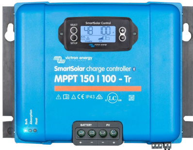
SmartSolar Charge Controller MPPT 150/100-Tr with optional pluggable display