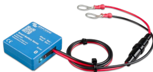
Bluetooth sensing: Smart Battery Sense