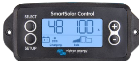
SmartSolar pluggable display