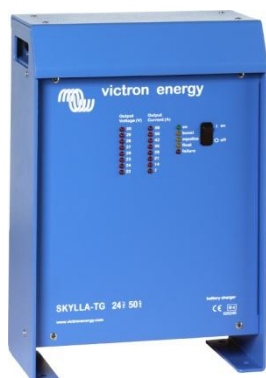
Skylla Charger 24V 50A