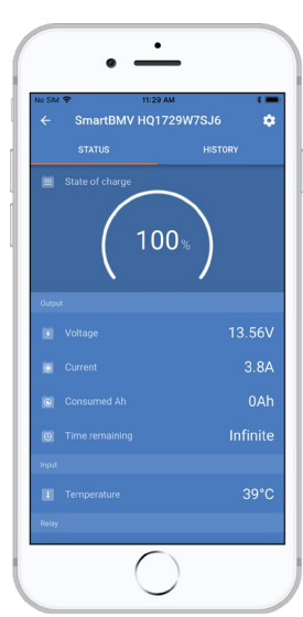
See the VictronConnect BMV app Discovery