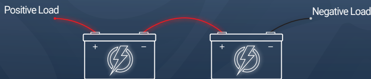
Series Connection 24V 270Ah Bank Increases Voltage, Ah stays the same.