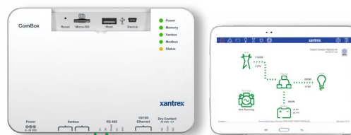
FREEDOM SW Conext Combox (809-0918)

Available telephone to network cable adapter to avoid the need to replace cables when replacing and old inverter. (#808-9010 sold separately)