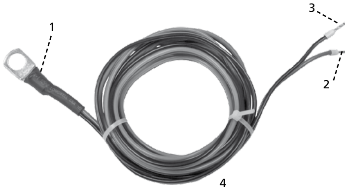
Fig.1 Components of Battery Temperature Sensor