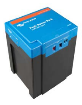
12,8 V 40 Ah

A Li-ion battery pack with intrinsically safe LiFePO4 cells, a built-in charger and outstanding peak output power performance.