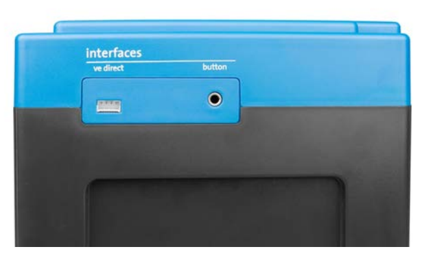
VE.Direct and button