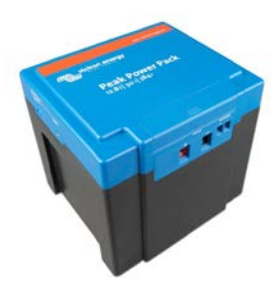
12,8 V 30 Ah