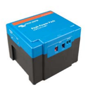
12,8 V 20 Ah