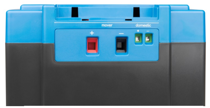
High current (mover) output and low current output