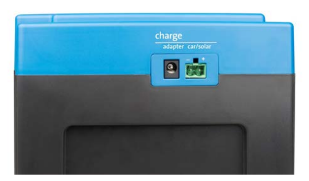
Power adaptor and vehicle/solar input