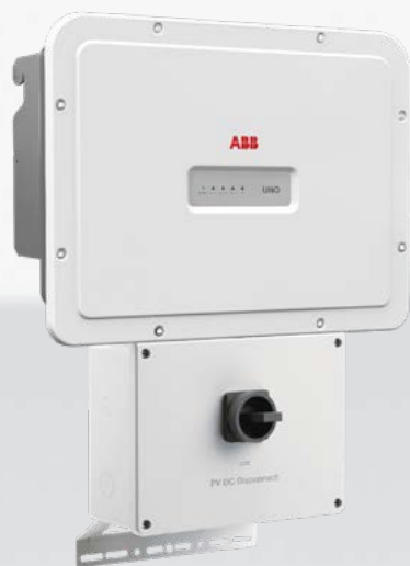
— UNO-DM-6.0-TL-PLUS-US-Q outdoor string inverter

The new design wraps ABB's quality and engineering into a light weight and compact package thanks to technological choices optimized for installations with different orientation.