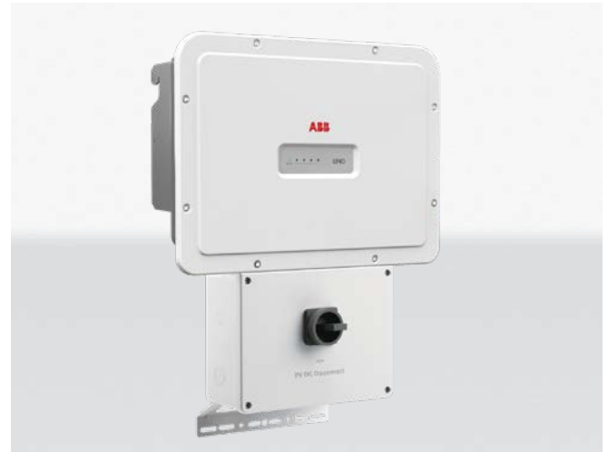
ABB string inverters UNO-DM-6.0-TL-PLUS-US-Q 6 kW