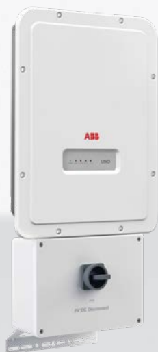
— UNO-DM-3.3/3.8/4.6/5.0-TL-PLUS-US-Q outdoor string inverter