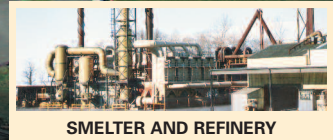
SMELTER AND REFINERY

QUALITY SYSTEM CERTIFIED ISO 9001 ISO/TS 16949 ENVIRONMENTAL SYSTEM CERTIFIED ISO 14001