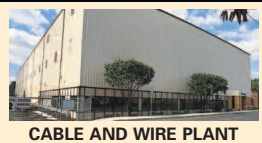
CABLE AND WIRE PLANT