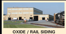
OXIDE / RAIL SIDING