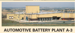
AUTOMOTIVE BATTERY PLANT A-3

QUALITY SYSTEM CERTIFIED ISO 9001 ISO/TS 16949 ENVIRONMENTAL SYSTEM CERTIFIED ISO 14001