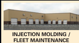
INJECTION MOLDING / FLEET MAINTENANCE