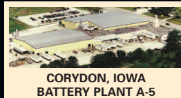
CORYDON, IOWA BATTERY PLANT A-5