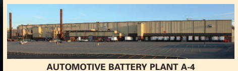
AUTOMOTIVE BATTERY PLANT A-4