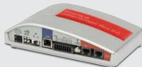
/ Fronius Datamanager Box 2.0