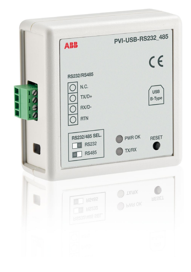
ABB monitoring and communications PVI-USB-RS232_485 Converter