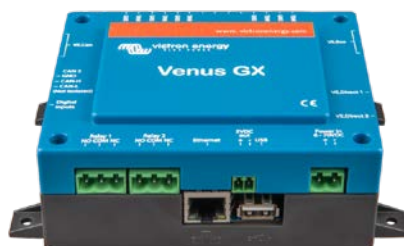
Venus GX front angle