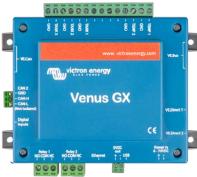
Venus GX with connectors