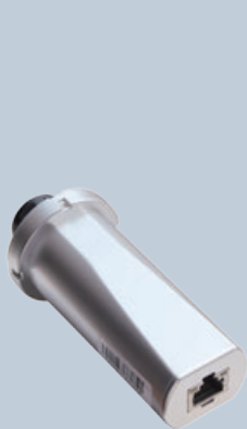
Data Logging Stick LAN