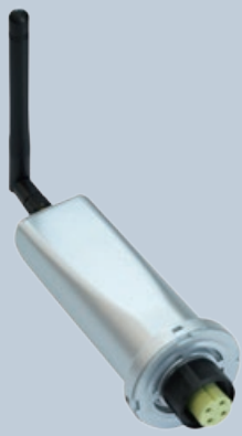
Data Logging Stick WIFI