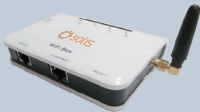
Data Logging Box DLB